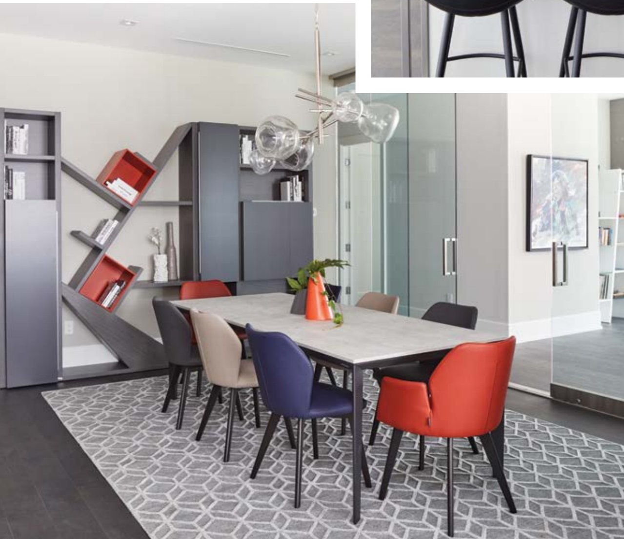
ABOVE: The large island also serves as a casual dining area. LEFT: A contemporary bookshelf provides organization and a place to display treasures. OPPOSITE, TOP: The sunlit library is a tranquil space to read or relax. BOTTOM: Graphic rugs throughout add interest.