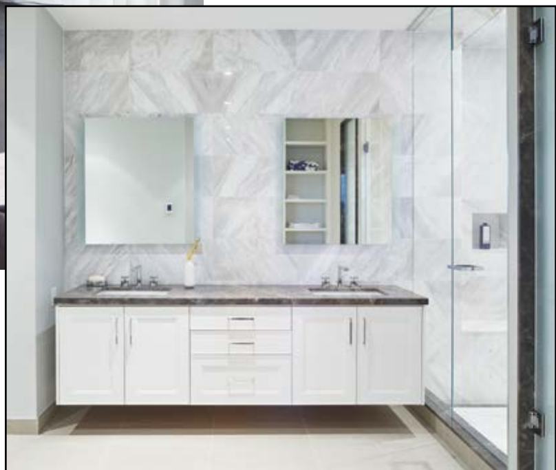
ABOVE: Modular style makes it easy to create a cosy corner in every space. RIGHT: Cool floor-to-ceiling tile and floating cabinetry maintain the modern vibe.

A spacious, furnished terrace offers priceless views from the heart of the city. Despite decorating the apartment with the intention to sell or rent, by the end of the project, the homeowner was so smitten with the final design that he is thinking about keeping it for himself, says Sylvie. If he follows the stars, surely there’s no better place to be. OH